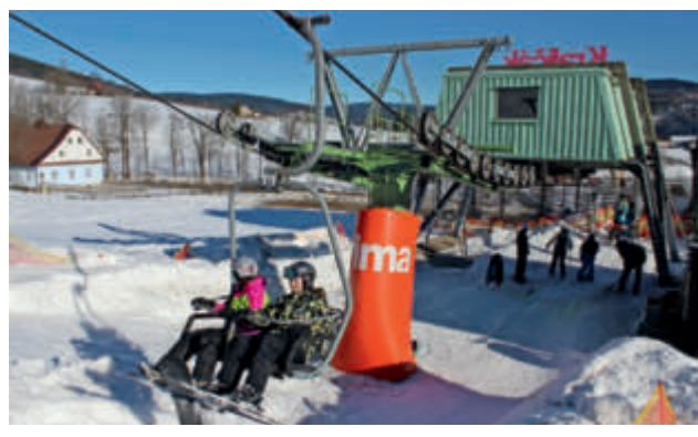
This double chairlift was in operation in Stříbrnice between 2008 and 2020.

In 2008 work began on the construction of a double chairlift up the wooded slope of Štvanice hill from Stříbrnice. Manufactured by Doppelmayr in Lana, this lift was in operation in Bormio, Italy, from 1982 to 2004. The chairlift was relocated to Stříbrnice to serve a ski slope about 1,000 m long, with an attractive steeper ski slope along the line of the lift added later. One year after the opening of the double chairlift, a new snowmaking system was installed and two surface lifts were built to connect Štvanice hill with Hynčice pod Sušinou in the neighboring valley.