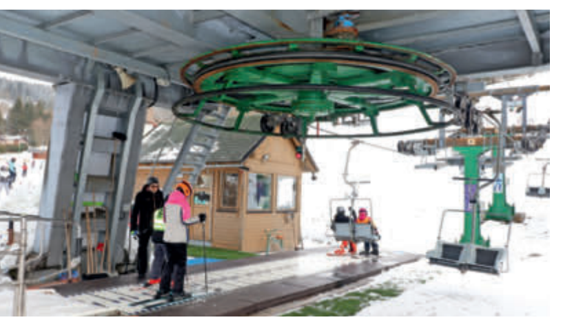
The used double chairlift on the Čenkovice side was fully refurbished prior to installation in the area.