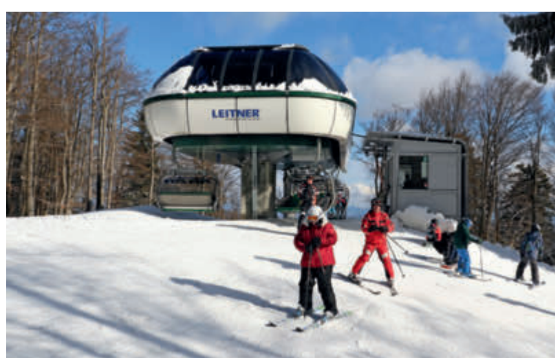
The top station of the Buková hora chairlift is a return station with a high enclosure.

The ski clubs in Česká Třebová and Čenkovice built a ski area with ski lifts in Čenkovice on the other side of Buková hora back in the 1960s. In 2011, the operators of this traditional ski area replaced two surface lifts with a used fixed-grip double chairlift manufactured by Steurer. The installation first did service in Werfenweng from 1982 to 2001 and then in the Czech Lipno – Kramolín ski area from 2003 to 2008. So Čenkovice is the third site of this chairlift, which was duly rejuvenated for the purpose, with a new drive unit, new control system, hydraulic tensioning instead of the original counterweight system for the haul rope, and the addition of a loading conveyor.