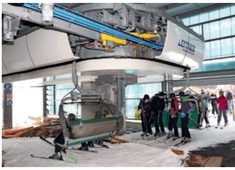
Ninety degree loading in the bottom station