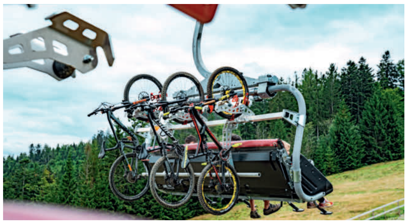
A 6-seater chair carrying three bikes on the Geisskopfbahn (Germany)

LEITNER New transport systems create maximum flexibility for all bike adventure seekers.