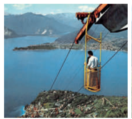
The first ropeway from Laveno Mombello to Poggio Sant'Elsa had yellow open bucket carriers for two passengers.

The open-air ride soon became very popular. Unlike on a chairlift, where passengers can hardly take in the view behind them as they ride up the mountain, the open bucket carriers permit passengers to turn in any direction they want during the ride and enjoy 360^{\circ} views of the lake and the landscape all the way to the highest Swiss mountains in the Monte Rosa massif. With the help of binoculars, it is even possible to see the towers of Milan Cathedral from the top station when visibility is good. Soon after the lift went into service, in 1965, a small ski area with a surface lift was established by the top station. It remained operational until the