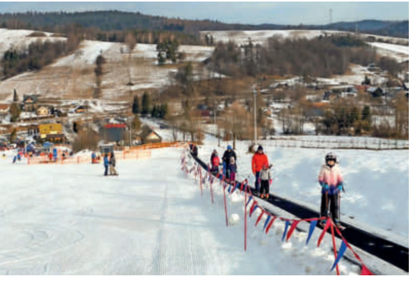
The new moving carpets installed at Bieszczad Ski in Wańkowa, Poland, are ideal for young and old to learn to ski.

SUNKID Bieszczad Ski in Wańkowa is a family ski area in the Bieszczady Mountains in the south of Poland. With a major capital investment over the last few years, the ski area has further enhanced its offering for families. The new facilities include three Sunkid Moving Carpets.