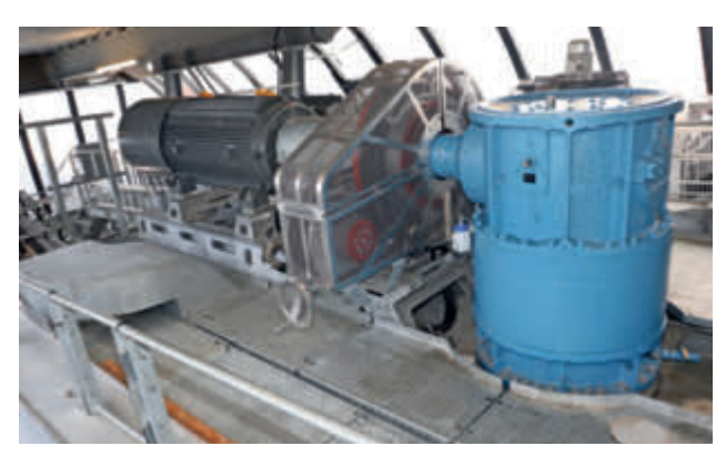
A classic electric drive with gearbox is located in the top station of the 6-seater chairlift.

In 2020, the municipality of Hynčice pod Sušinou opened the Kaple double chairlift on Štvanice hill. This Doppelmayr lift, which was formerly in operation on the Wildkogelscharte in Neukirchen am Grossvenediger, has hydraulic tensioning in the bottom station and an underfloor drive in the top sta-