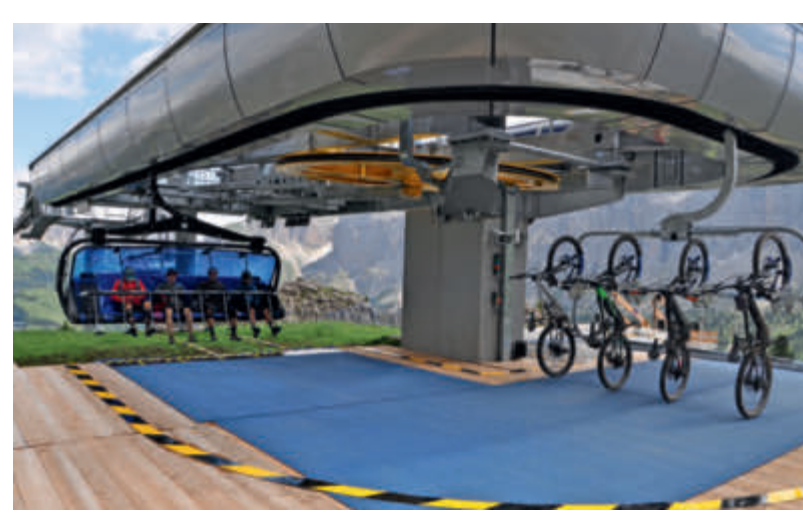
One of the seven bike carriers for a maximum of four bikes in the top station of the Gran Paradiso 8-seater chairlift (Italy). A stop & go procedure is used for safe unloading.

The Bike Box developed by Leitner as a test station allows bikers to familiarize themselves with the new system. The box can be set up near the ropeway boarding area, providing an opportunity to practice handling before boarding. In addition to the boarding procedure, bikers will also find information on the requirements for the bike to ensure safe transport. To make the boarding procedure even easier to understand, the box also features pictograms. Alternatively, a screen can be integrated into the box to display an explanatory video for the procedure.