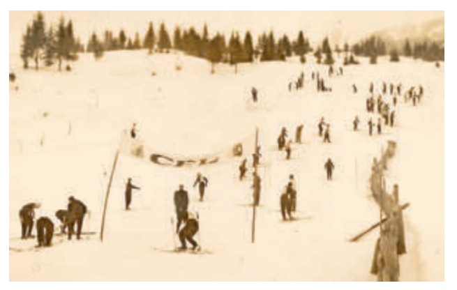
Finishing area of the "Olympiapiste" for an alpine ski race in 1940

Also, in 1943 the engineer Frigyes Benedek and the Polish ski jumper Stanislaw Marusarz began to plan and build a ski jump, which was Europe's largest natural jump hill (no tower needed for the track). The ski jump was used until the 1990s and its remains can still be seen today.