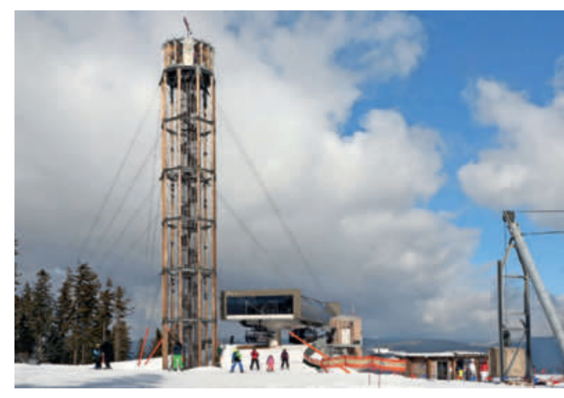
At the top station the Kraličák ski resort has a 35 m high observation tower.

The 6-seater chairlift is equipped with protective canopies,