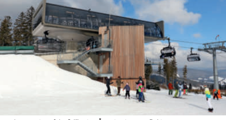
... and top station of the Stříbrnice–Štvanice 6-seater D-Line chairlift

tion. Like the Stříbrnice—Štvanice chairlift, it also runs in summer, serving a network of paths for hikers to the line of the fortifications which were built between 1936 and 1938 on what was then the border between Germany and Czechoslovakia and are now promoted with 13 information boards and historical exhibitions in the old bunkers. In summer the two chairlifts also carry mountain bikers to their trails.