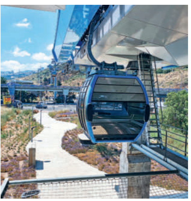
The ropeway runs from mornings to evenings for up to 19 hours and can handle a daily ridage of 20,000 passengers.

The campus is the destination not only of the almost 35,000 students of the Technion and University and their staff, but