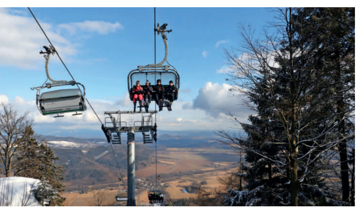
After twelve years of operation, the Buková hora quad chairlift is still very much up to date in terms of the quality of the ride.