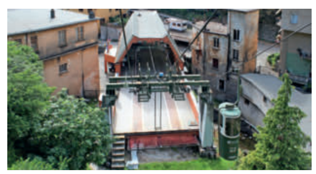
The bottom station is located in the middle of the built-up area of Laveno

early 1980s, when it closed due to a lack of snow. Since 1975 Poggio Sant'Elsa has become a popular take-off point for hang gliders and paragliders.