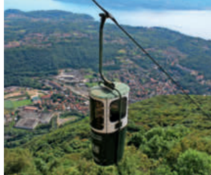
Today, passengers can choose between open and enclosed vehicles. Both offer wonderful views