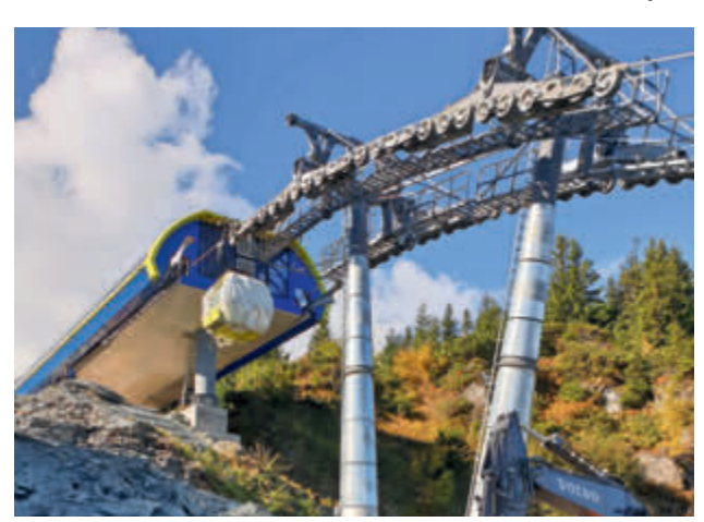
Earthworks for the ski trail in the area of the top station

In addition to the Olympia Sport Hotel built in 1944 (now the Stibina Hotel), another three hotels were constructed, two located near the ski slopes and one in the center of the town. Two smaller ski-jumps were also added to the existing one, and in that period a number of national alpine ski contests and international ski jumping contests took place in Borşa.