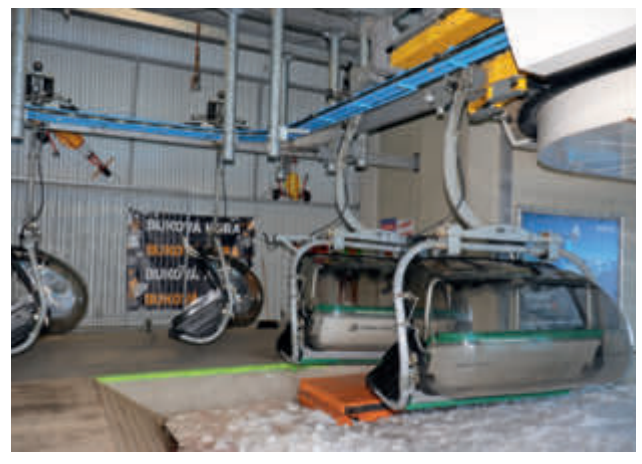
Semi-automatic parking for the chairs in the bottom station