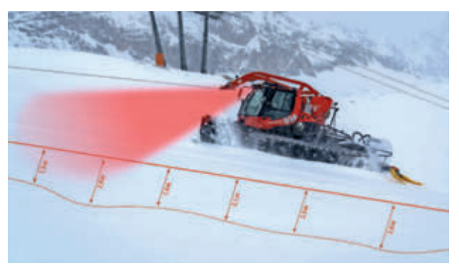
SNOWsat LiDAR provides the operator with real-time data on snow depth up to 50 m in front of and alongside of the vehicle.

mines when which snow cannons need to be activated. This makes it possible to optimize the times at which snow groomers and snowmaking machines are used based on need. Maximum efficiency, operating safety and sustainable handling of the available resources – professional snow management is the guarantee for good slope quality and safe and economical operations from the first to the last day of the season.