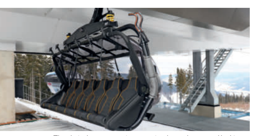
The chairs have protective canopies, heated seats and locking safety bars with footrests. Note the hinged carrier for bikes and other sports equipment on the frame of the chair.