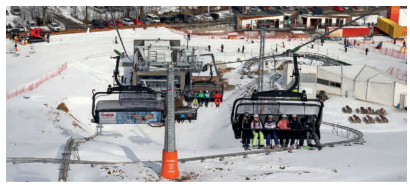
The first \,D-Line \,chair lift \,in \,the \,Czech \,Republic \,is \,now \,operating \,in \,the \,Krali\check{c}\acute{a}k \,ski \,area \,(here \,looking \,towards \,the \,bottom \,station).

ISR REPORT In 2020, the first Doppelmayr/Garaventa D-Line lift in the Czech Republic was built in the Kraličák ski resort.