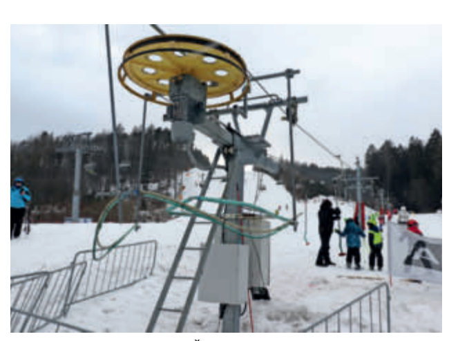
The children's ski school in Červená Voda with its own surface lift