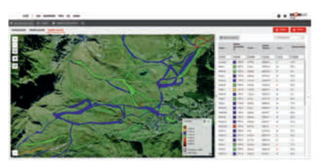
Snow depth measurement and snow management are part of the SNOWs at platform.

The production of artificial snow is one of the largest cost items in a ski area. SNOWsat provides detailed information about the location of unsuspected snow depots, about where the remaining snow cover is only very thin and deter-