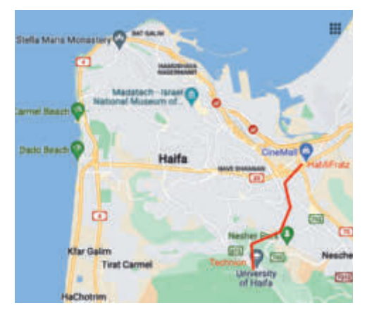
Fig. 1: The line of the Rakavlit cable car in Haifa (base map: Google Maps)

The project initially got underway in 2006. For the link between the HaMiFratz mobility hub and the Technion , Israel's largest research facility, and the Haifa University campus on Mount Carmel, Adam Ringer presented a plan for a three-section 8-passenger monocable circulating ropeway. Figure 1 shows the line of the Rakavlit cable car in Haifa. The name given to the ropeway at the time was Haifa Bay – Technion – University Ropeway (HBTU) .