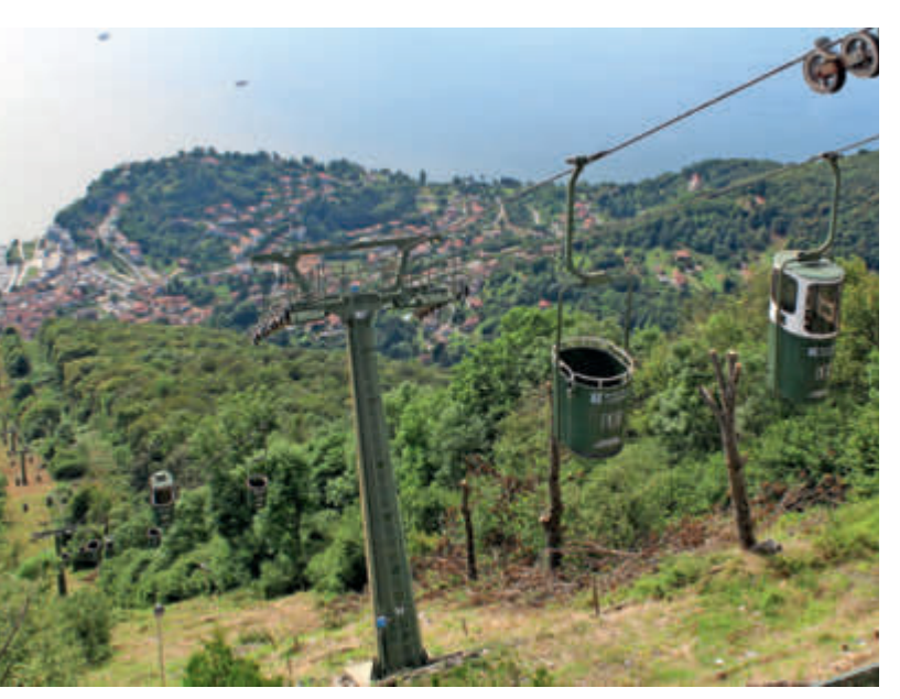
The Funivia del Lago Maggiore has become the hallmark of Laveno.

ISR REPORT Of the bucket lifts that used to be common in Italy especially, only eleven are still in operation in the country today. ISR recently paid a visit to one of them, the cabinovia in Laveno Mombello on Lake Maggiore.