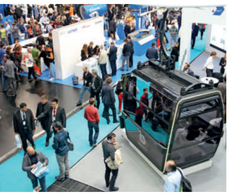
In 2023, Interalpin will be back for the first time since 2019.

Market-leading manufacturers and innovative companies from around the world flock to Tyrol for this international event. In 2019, the fair attracted 29,000 trade visitors from more than 117 countries, bringing together key industry players, service providers and decision-makers from the cable car industry.