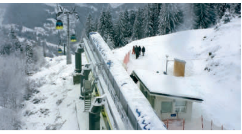
View from a cabin on the downhill line of the mid station located on the uphill line

the local authorities prepared another project, but this time only for a gondola lift for the old Olympia slope. The financing was finally approved, and a construction company won the tender. After a short while, however, the work was discontinued because the company went bankrupt. Some years later, this time with financial support from the government, a new tender was organized, and another company started on the work... until 2008 when it stopped once again, also due to insolvency.