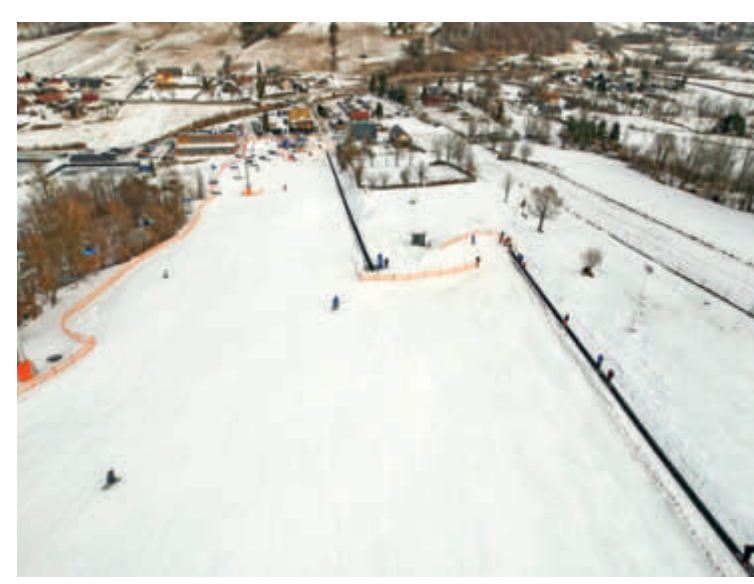
Moving carpet no. 1 serves as a feeder to moving carpet no. 2 at Bieszczad Ski. The two moving carpets of the same length offer easy access for beginners to the slope along the line of the chairlift.

All good things come in threes, as they say. The shortest of the three new moving carpets is 39 m long and is located in the area of the restaurant and ticket office on terrain with a slope of about 8%. Here the little ones can make their first turns with the help of their parents or learn to ski with a qualified instructor. Parents can watch and cheer them on from the restaurant. So young and old can look forward to the upcoming 2022/23 winter season.