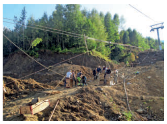
After ten years of construction work, the carrying-hauling rope was finally spliced.

Later, with the prospect of financial support from the EU,