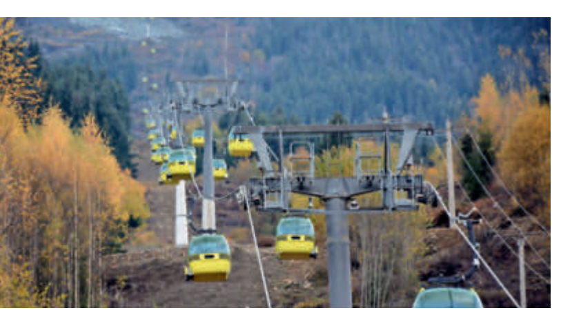
The finished 8-seater gondola lift prior to issue of the operating permit