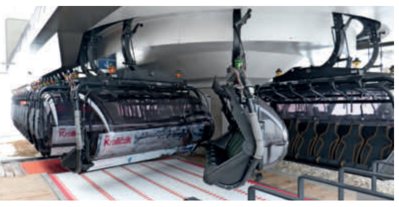
The chairs are parked on the turnaround in both stations.