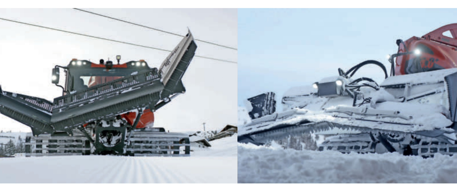
The new ProBlade has integrated hydraulic transport tines. The wings can be tilted backwards for better snow transport.