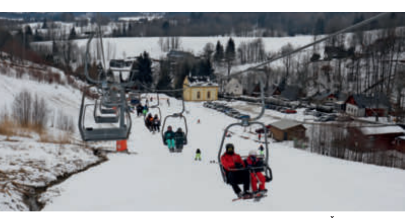
The Kaple double chairlift provides access to the Štvanice hill from the neighboring valley and connects the two entry points to the area for pedestrians and mountain bikers, too.