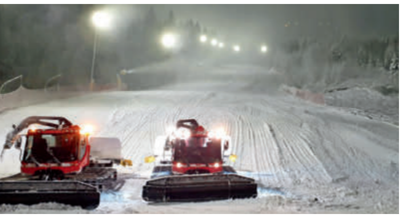
Professional snow grooming on the "Olympiapiste"