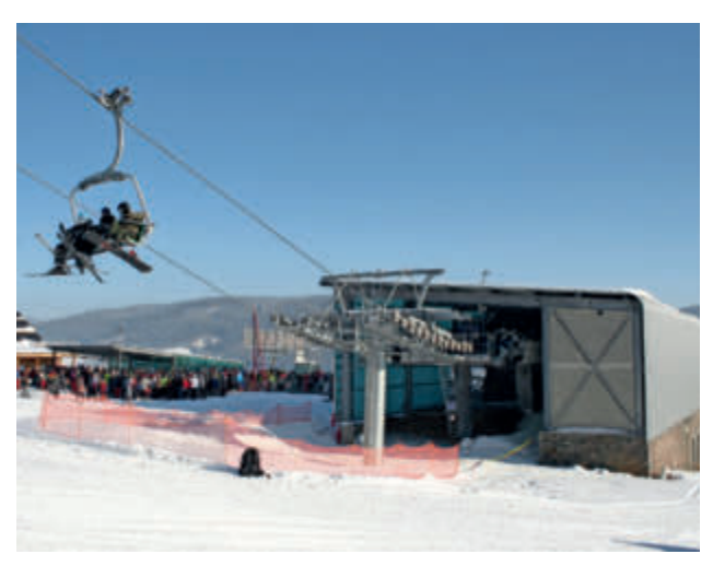
In its first winter season, the chairlift had chairs without bubbles and with low backrests.

The Buková hora success story began in December 2010 on the eastern slopes of the mountain, which had not had any ski lifts until then. The most important capital investment item was the construction by Leitner of the 1,672 m long detachable 4-seater chairlift from Červená Voda to Buková hora. The installation was the first chairlift with heated and padded seats in the Czech Republic and also the first new