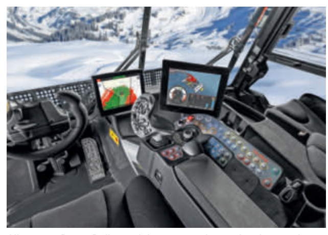
All current PistenBully models are now identical with regard to

"After testing the new ParkPro for 800 hours last winter, I can say that the dynamic controls, including the new joystick and the combination of ParkPro and winch, exactly match our thinking in park construction today!"