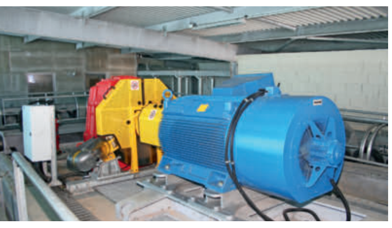
Hydraulic tensioning is used for the drive platform and bullwheel in the bottom station.