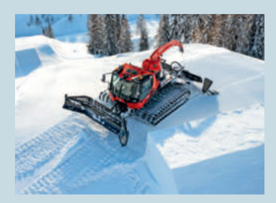
Lightweight and agile – and now also with a winch – the PistenBully 400 ParkPro W is ideal for grooming slopes and snow parks.