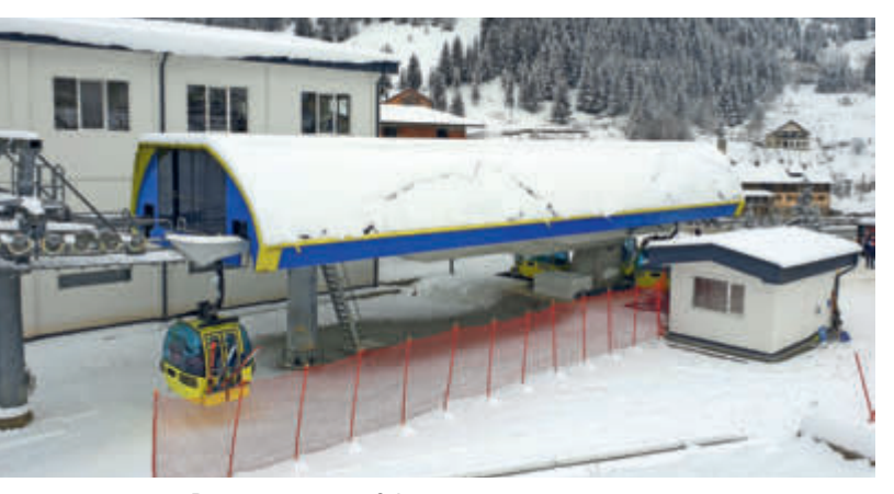
Bottom station of the ropeway