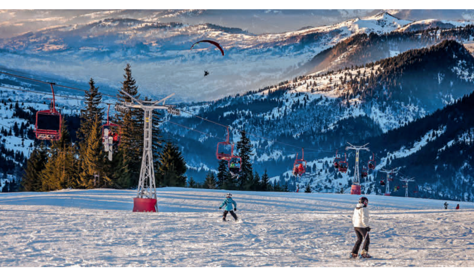
The double chairlift built in the 70s is still operating today.