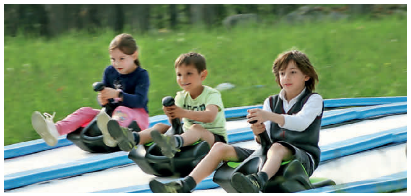
One of Sklide's strengths is the parallel run with tracks of equal length, one next to the other. This configuration allows for head-to-head challenges, adding even more adrenaline and entertainment to this sporting format.

NEVEPLAST The name Sklide , combining the words "ski" and "slide", speaks for itself. A colorful toboggan with a joystick in the middle, the new Sklidebob ensures healthy and intuitive fun and is an interesting product for the leisure business.