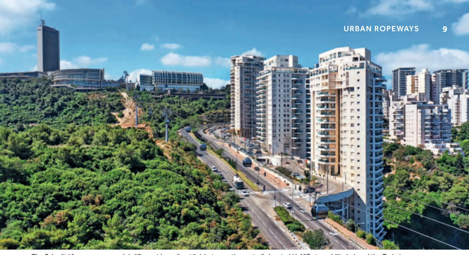
The Rakavlit 10-passenger gondola lift provides a direct link between the centrally located HaMiFratz mobility hub and the Technion , Israel's largest research facility, and the Haifa University campus.